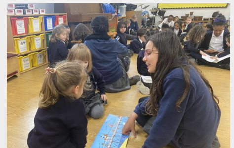
Year 6 buddy reading with Nursery